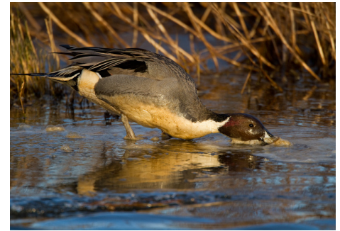
Northern Pintail. Mike Dunn

algorithm to evaluate possible management action portfolios and identify the preferred option (i.e., the combination of management actions that maximized objectives). Expert elicitation procedures were used to build predictive models of expected waterfowl and shorebird use-days, the criteria used to evaluate the benefits of each management action portfolio. Weights were assigned to waterfowl and shorebird use-day objectives to capture their differential importance in the refuge decision-making process. Nonbreeding waterfowl were most heavily weighted to reflect the refuge’s primary purpose, and fall shorebirds were given higher weights than spring shorebirds to meet demand for a general lack of suitable fall shorebird habitat in this region. Five scenarios were developed with a variety of objective weights and budget constraints to help identify the optimal portfolio. This enabled refuge staff to explore the sensitivity of their management decisions to the importance of their management objectives and budget constraints.