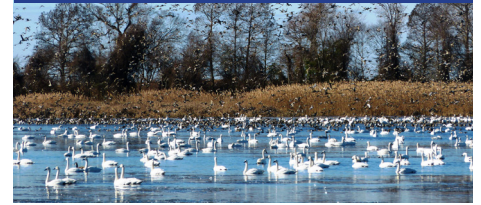
Mixed Flock. Henry McLin

Integrated wetland management for waterfowl and shorebirds at Mattamuskeet National Wildlife Refuge, North Carolina: U.S. Geological Survey Open-File Report 2017-1052, 43 p., https://doi.org/10.3133/ofr20171052